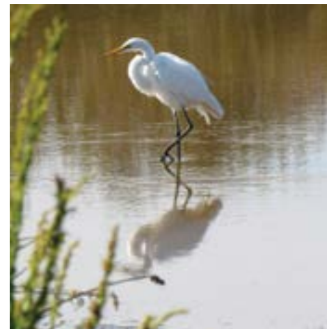
Great egret.